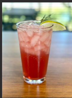
BLACKBERRY GINGER FIZZ

STRAWBERRIES AND BASIL MUDDLED TOGETHER. TOPPED WITH AGAVE SYRUP AND STARRY LEMON LIME SODA.