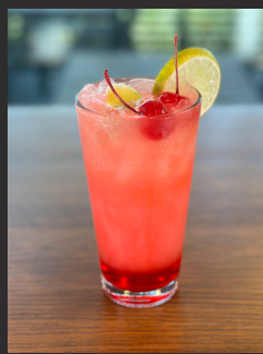
CHERRY LIME FIZZ

BLACKBERRY SYRUP, FRESH LIME JUICE, GINGER BEER, TOPPED WITH STARRY LEMON LIME SODA.