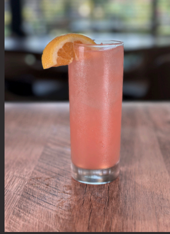
ACTUALLY, PERFECTLY PINK LÉMONADE

Citron Vodka, Razzmatazz, Lemonade, Pomegranate Syrup