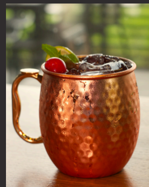
CRANBERRY MOSCOW MULE

Citron Vodka, Cointreau, fresh Lime Juice, and Simple Syrup