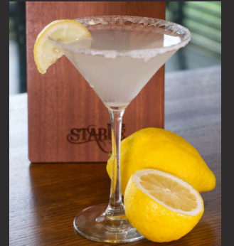
WEBBER'S CITRUS MARTINI

Pinot Grigio, Brandy, Simple Syrup, Peach Puree, Pineapple Juice, and Orange Juice