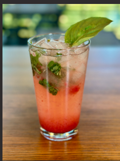
STRAWBERRY BASIL SMASH

STRAWBERRIES AND BASIL MUDDLED TOGETHER. TOPPED WITH AGAVE SYRUP AND STARRY LEMON LIME SODA.