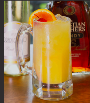
WHITE PEACH SANGRIA

Rye Whiskey, Sweet Vermouth, Bitters. Served with a Luxardo Cherry